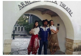
Magik goes whole hog with new Renaissance fair