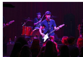
American Kings outgrow the Zots