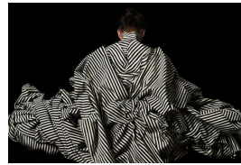
Invisible artist emerges from the background of her works