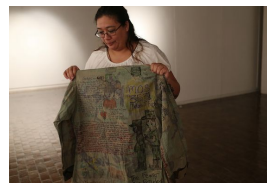
Veterans share their experiences through art

“I can only do what I know,” he said. “It’s really something, when I came back, I needed to express, I think. It really helped my development as getting some of that stuff that happened