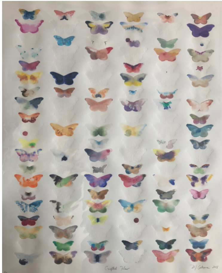
Margarita Cabrera, Crafted Flow - Butterfly suite - 3/15, 2018. Blind debossed print with artist applied watercolor.

butterflies are shown with color, perhaps as a metaphor that not all of the monarchs who migrate make it, and for the ones who do, they are left a little bit different from the rest.