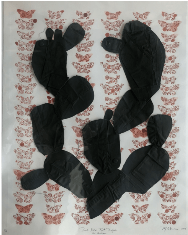
Margarita Cabrera, Time Does Not Forgive (New Landscape) - Butterfly Suite - 2/15, 2018 . Relief print with artist applied border patrol uniform fabric and watercolor

shade, medicinal comfort, or nutrient enriched livelihood.