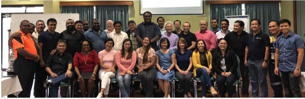
Photo: Fisheries Minister, Board Chairman, NFA MD & Staff, FIA Staff and Representatives of the Tuna Processors attending the Rebate Scheme Consultation

The first consultation on the Rebate Scheme (RBS) between the National Fisheries Authority and the Tuna Processors was held on the 20 th January, at the Lae International Hotel, Lae, Morobe Province.