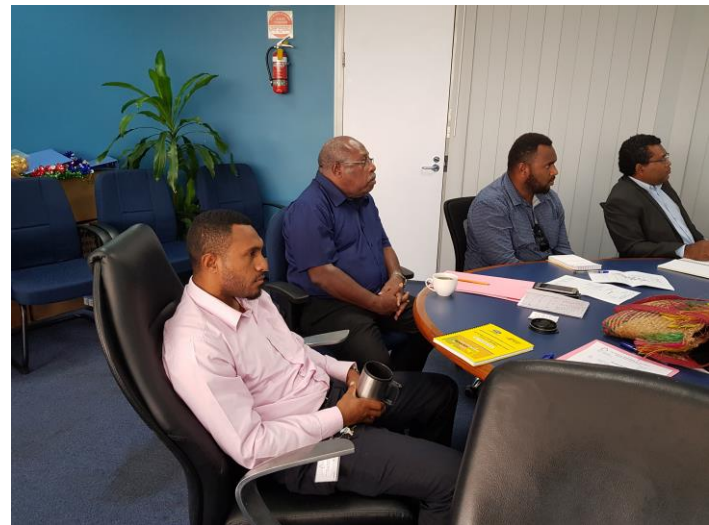
Photo: FIA President/Chair attending the FTLC meeting