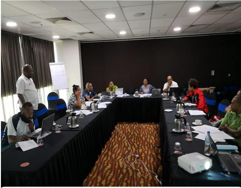
Representatives of NFA and FIA attending the workshop at Grand Papua Hotel

A workshop was convened by the Audit & Certification Unit of NFA to review the draft PNG Standards, particularly on Part 2 - Export Commodity Trade Requirements and Part 3 - Import Commodity Trade Requirements.