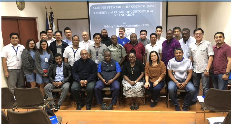
FIA Media File: Group Photos of Participants attending the PNG FIA MSC Roundtable Workshop, Navotas City, Manila, Philippines

The PNG Fishing Industry Association (PNG FIA) held its first roundtable workshop with stakeholders in Navotas City, Manila, Philippines, to discuss the assessment process of the PNG FIA MSC certification.