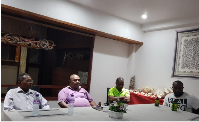
Representatives of NI BDM Exporters attending the meeting, Malangan Resort, Kavieng