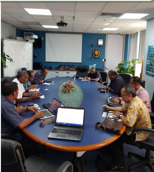
Representatives of NFA, FIA and Delta Pacific Indotuna during the fact-finding meeting

mission to seek baseline information regarding their need to source raw tuna materials in PNG for their cannery and cold storage operations in Sulawesi, Indonesia. They are predominantly a tuna processing company. They have a 70 mt tuna cannery (including cold