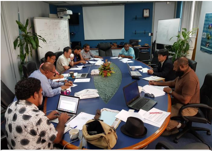
NFA Staff, FIA Staff and OFCF Staff consulting on the OFCF purse seine training programme at the NFA Boardroom

The FIA was invited to attend a consultation on Monday 23 April 2018, held at the NFA Boardroom, to discuss the OFCF's sponsored Training Program onboard Japanese Purse Seine Vessel. The Consultation was attended by representatives from NFA, FIA and OFCF, Japan.