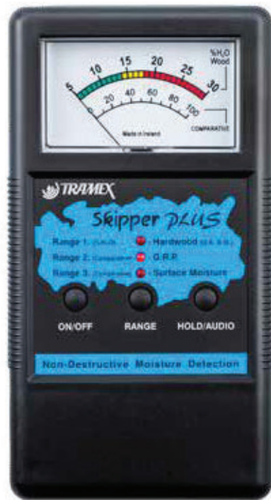
Product Code : SMP

Osmosis, also known as Gelcoat Blistering, is found in GRP hulls when moisture soaks into the hull surface, collects between the glassfibre and plastic laminate, resulting in blistering of the gelcoat. Usually found on or below the waterline, Osmosis dramatically reduces the structural strength of the hull and the value of a boat.