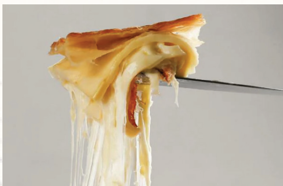
THREE CHEESE 10