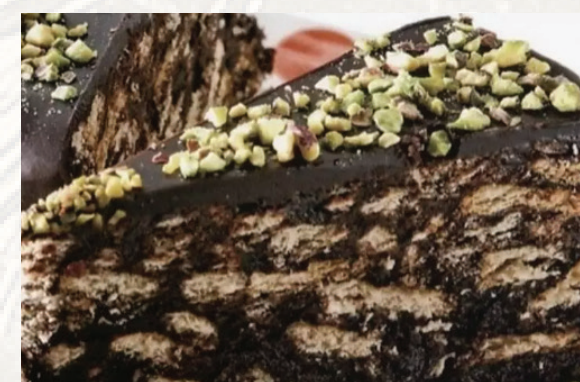
MOZAIK CAKE 9

Turkish chocolate cake is a rich, moist dessert made with deep cocoa flavor and soaked in chocolate syrup. It's soft and fudgy.