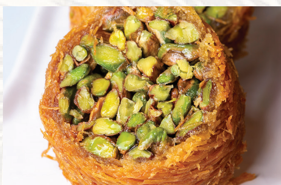
HALEP BURMA 5

Künefe is a warm Turkish dessert made with shredded phyllo dough (kataifi), filled with melted cheese, and soaked in sweet syrup. It's crispy on the outside, melty inside, and often topped with pistachios.