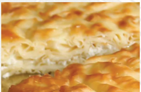
WITH KASHAR 10

Served with: Turkish cream cheese (optional butter/jam)