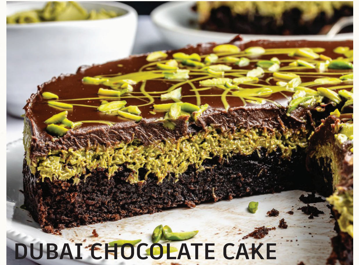
DUBAI CHOCOLATE CAKE