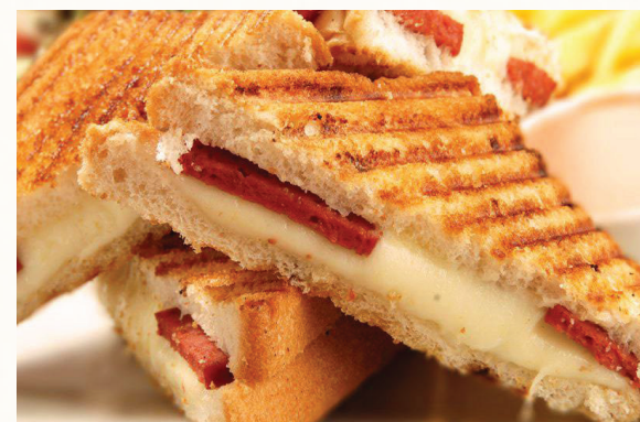
WITH SUCUK 12