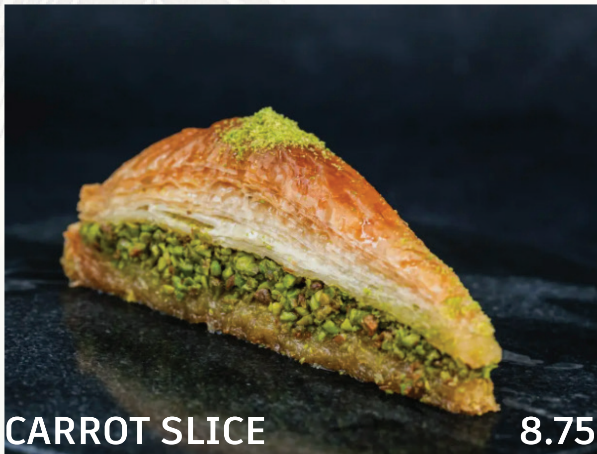
CARROT SLICE 8.75