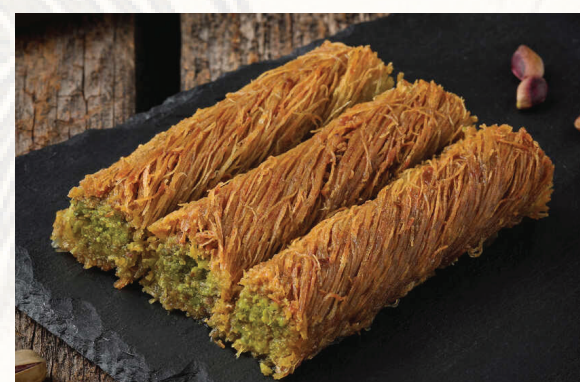
BURMA KADAYIF 9