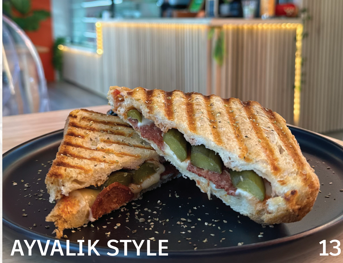
AYVALIK STYLE 13

Served with: Turkish black olives, tomatoes and salad