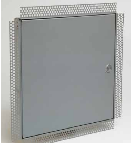
Pictured: CSNFFPA Acc RW31