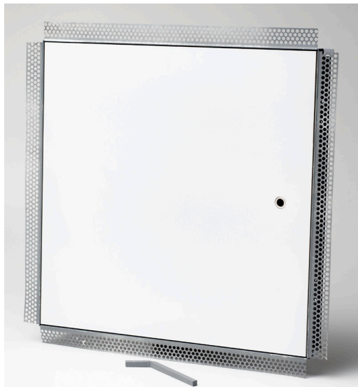
Pictured: FMAB RW45