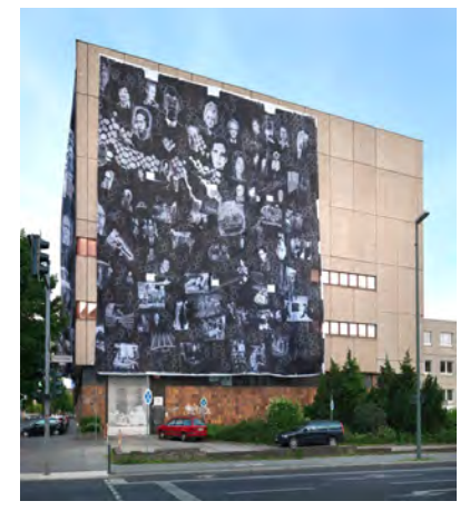
Fig. 5. Thomas Kilpper, State of Control (2009), linocuts on paper, exterior façade of former Stasi headquarters, Berlin.

The German artist Thomas Kilpper is best known for carving enormous matrices into the floors of abandoned buildings and then printing them. What distinguishes Kilpper's work, apart from its sheer scale, is the explicit elucidation of social and political histories in his sprawling imagery. His first major project, The Ring (2000), was executed on the tenth floor of Orbit House in Southwark, London, where Kilpper carved a 400 square meter woodcut into the mahogany parquet floor. The visual narrative begins with the octagonal Surrey Chapel, which occupied the site of Orbit House in the 18th century; it continues with images of boxing, for which the location was