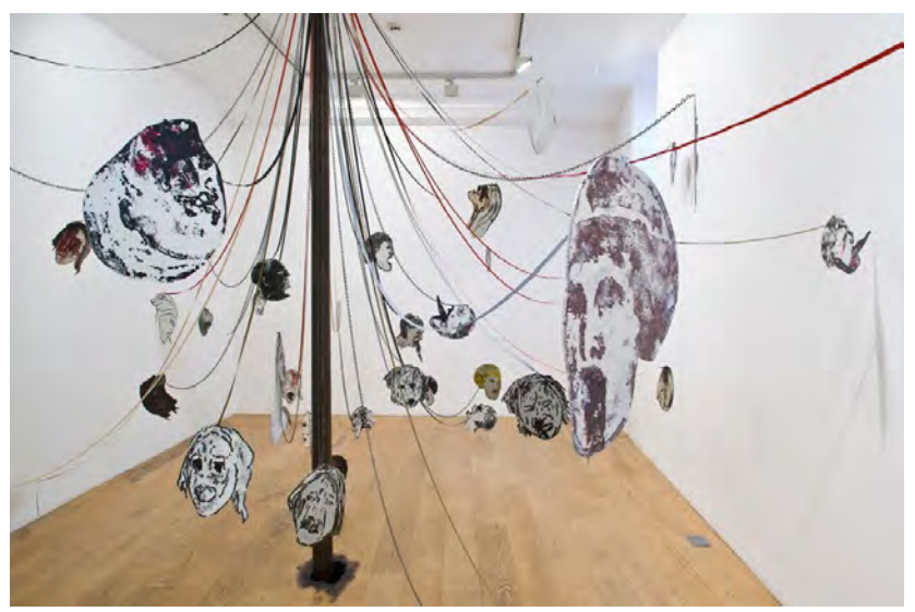
Fig. 3. Nancy Spero, Maypole Take No Prisoners II (2008), steel, silk, wood, nylon monofilament, hand print on aluminum, installation view at Anthony Reynolds Gallery, London, 2008, ©The Estate of Nancy Spero, courtesy Galerie Lelong, New York.

the audience was invited to contribute creatively to the artwork's conceptual resolution.