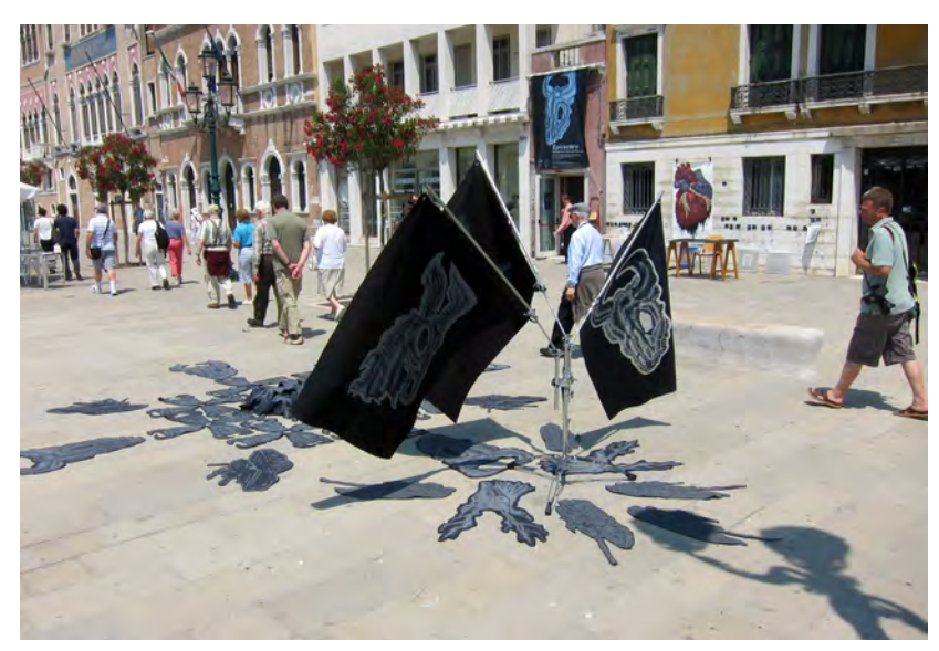
Fig. 7 John Hitchcock, Epicentro Retracing the Plains (2011), Venice, Italy.

And what are we to make of Regina Silveira's print-based works? Over the last four decades Silveira has experimented with silkscreen, lithography, offset, photocopying, and blueprint, but she is best known for her installa-