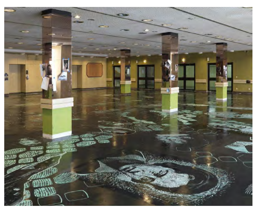
Fig. 4. Thomas Kilpper, State of Control (2009), carved linoleum floor of the former Stasi headquarters, Berlin.

Kilpper's work extends, in intriguing and dramatic ways, both the physical impact of the print and its social and procedural accessibility. The 'how' and 'where' of print production are often frustratingly invisible to viewers—in Kilpper's work these things are not only evident but are the basis of the