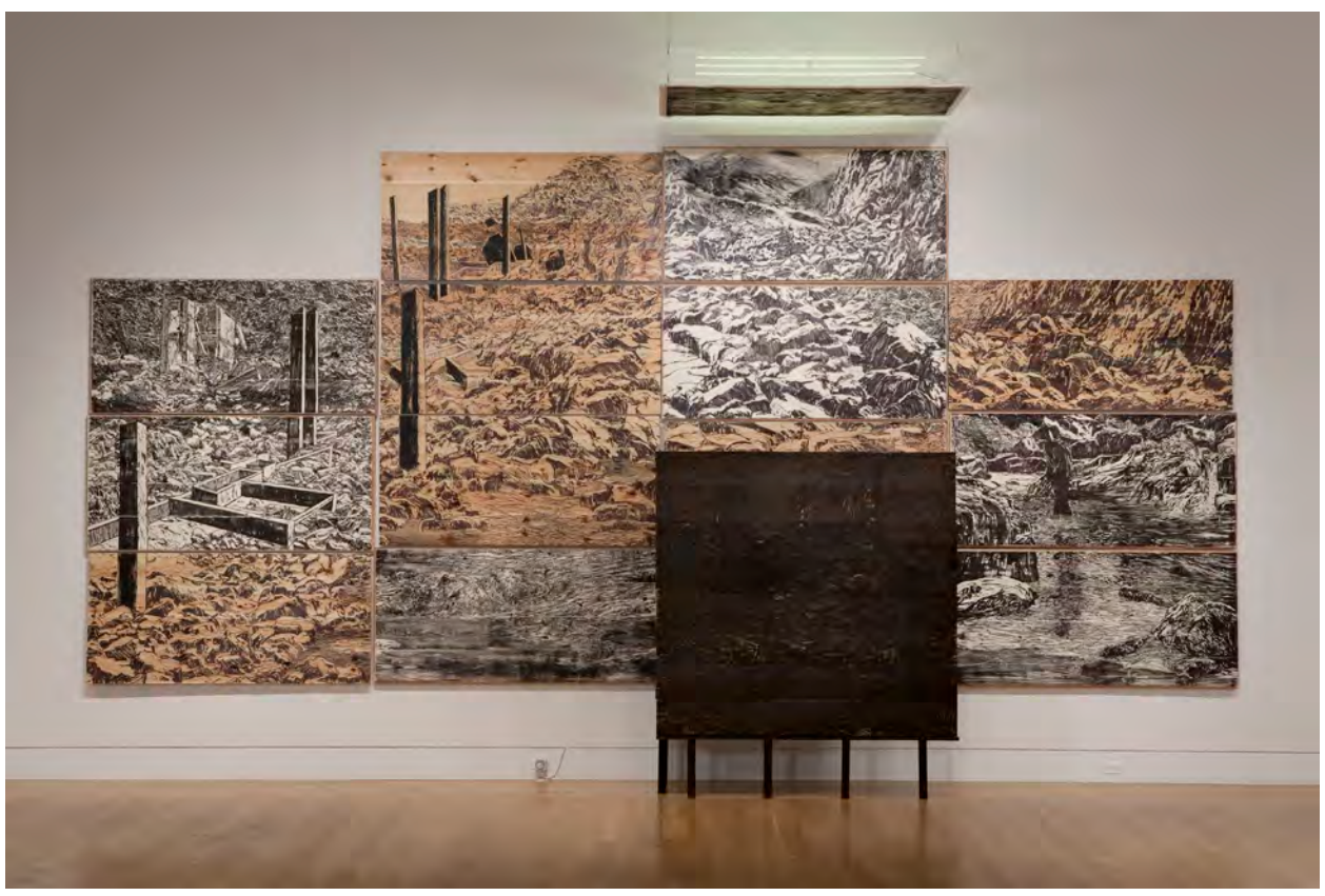
Fig. 6. Orit Hofshi, If the Tread is an Echo (2009), woodcut, ink drawing, and stone tusche rubbing on carved pine wood panels and handmade paper, 136 x 287 x 36 inches.

tions of black laser-cut vinyl adhesive. For Irruption (2005 and 2006) (Fig. 6) Silveira applied thousands of black vinyl footprints to a gallery space at the Museum of Fine Arts in Houston. The following year she adhered the same black footprints to the exterior of the Taipei Arts Museum during the 6th Taipei Biennial. In Bishop's terms, the work in Houston would be an installation while the one in Taipei would not, though the artist considers them both manifestations of the same piece.