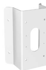
DS-1476ZJ-SUS Corner Mount