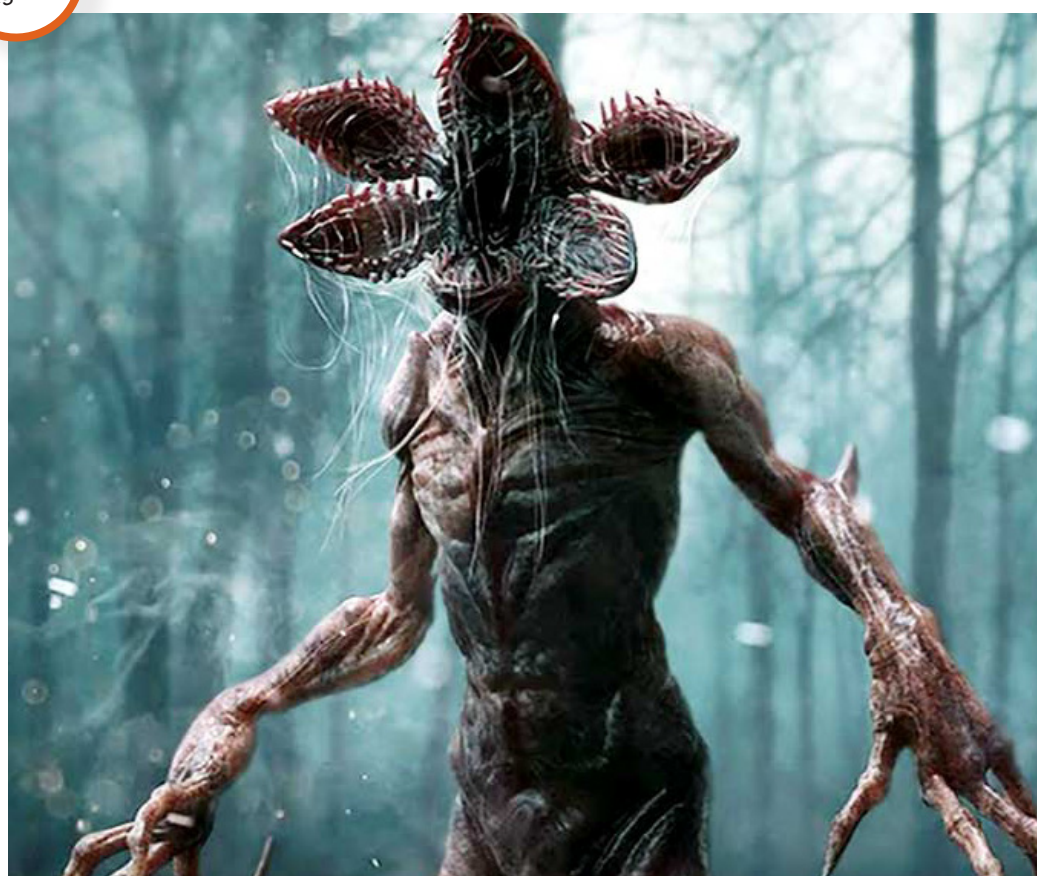
Above: The fear inducing Dart from Stranger Things season 2.