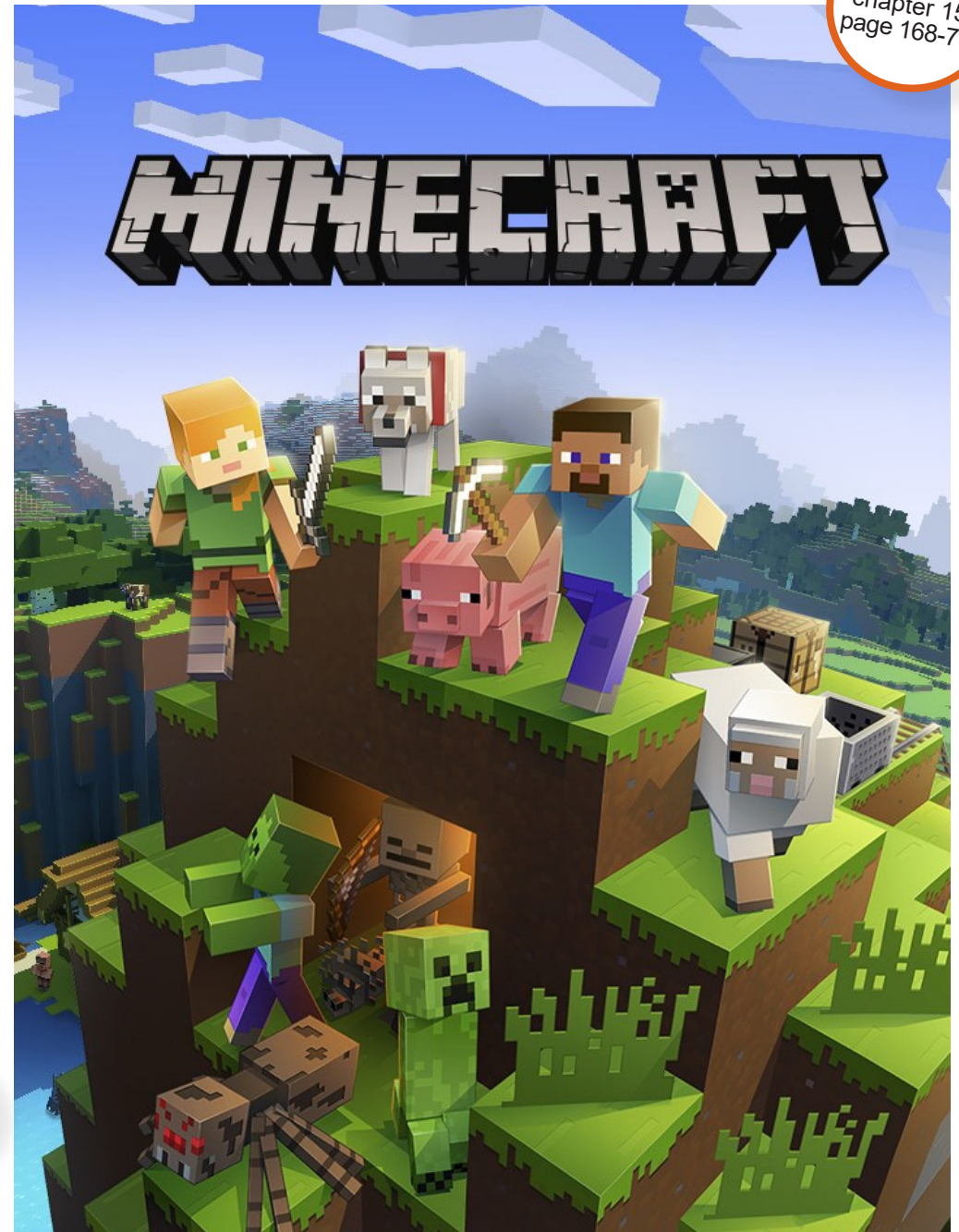
Above: The co-operative creative game play of Minecraft challenges the argument that all video games create violent behaviours.