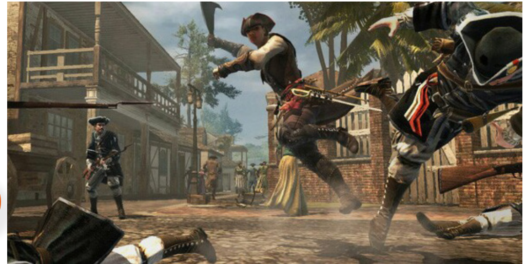
Above: Screen grab from Assassin's Creed Liberation. Can gamers tell the difference between game play and real-world violence?

3. What three arguments does Jenkins forward to critique the view that video games are responsible for real-world violence?