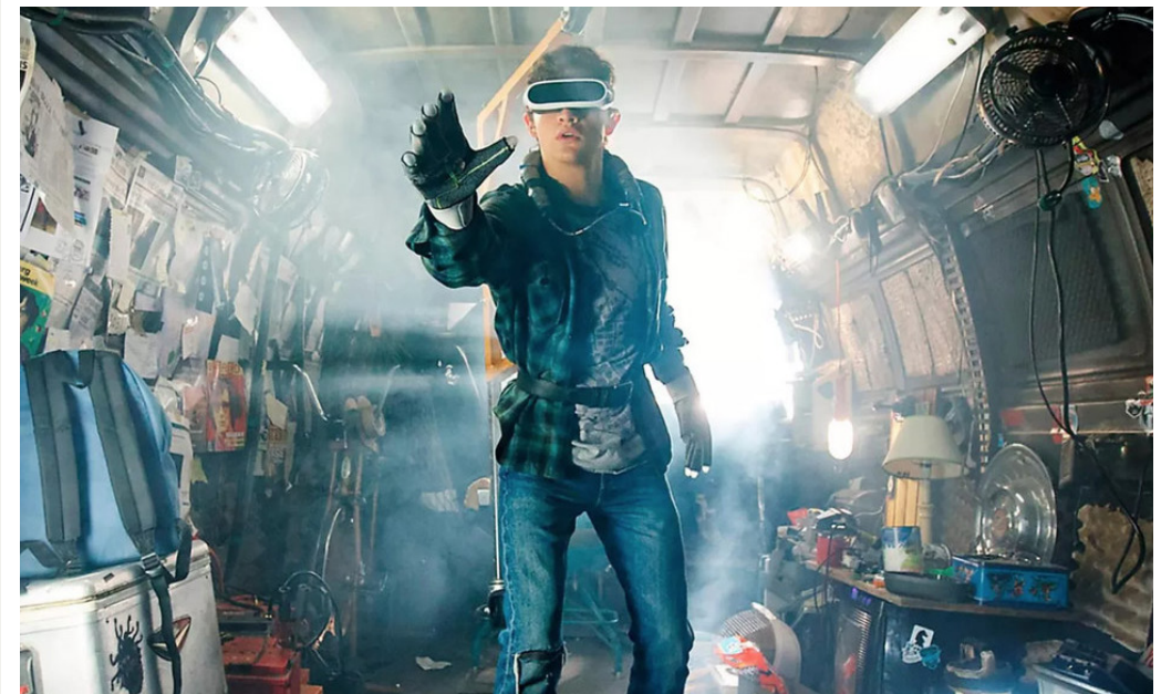
Above: Apple iPhone advert (2017) and a still from Spielberg's cyber-dystopian hit Ready Player One - two radically different views of technology. Which version do you think is most accurate?