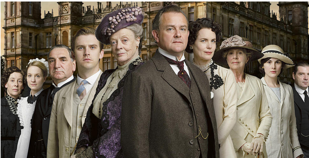
Above: The hit ITV show and film, Downton Abbey. Albionic representations are often critiqued because they don't reflect the real world ethnic diversity of contemporary Britain.

D. What effect does the headline's labelling of the UK as 'Great Britain' create?