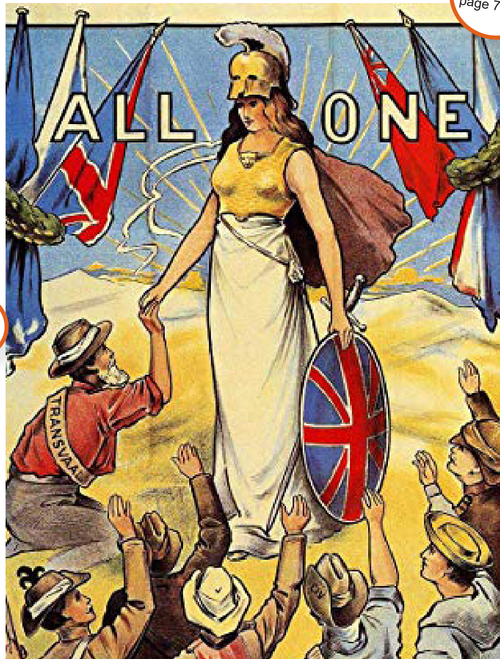
Above: Empire propaganda poster: the colonial nations pay tribute to the might of imperial British rule.