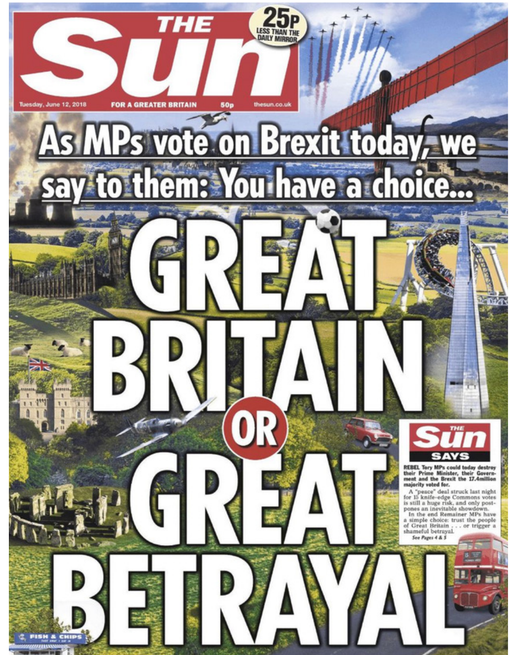
Above: Sun front cover (2018) - an albionic representation of the UK constructed using rural imagery and nostalgia.