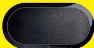
Jabra Speak 810