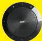
Jabra Speak 510