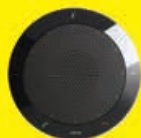
Jabra Speak 410

Jabra offers unmatched support and Service