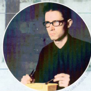
Evil in Progress by Luke Landry