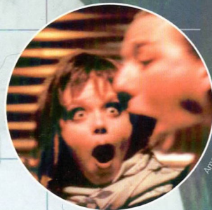
American Theater Nexus