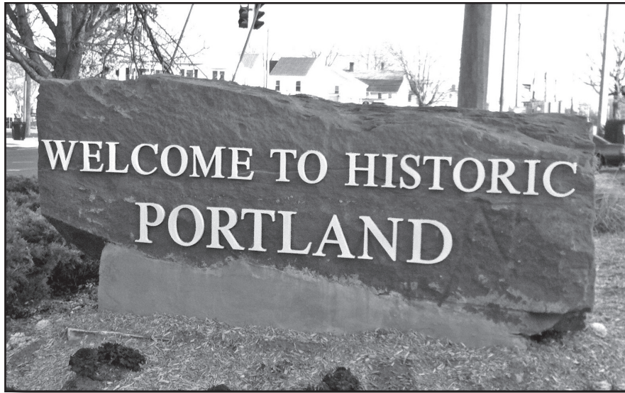
A 9000 lb. slab of brownstone, cut from the Portland Brownstone Quarries to create this welcoming sign installed on Rt. 66, is one of the first things motorists see as they come off the bridge from Middletown.