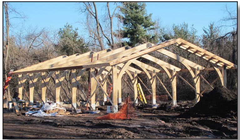
UNDER CONSTRUCTION: The 50' x 30' pavilion at Portland Riverfront Park is the newest feature to appear on the property. It will be available for rental sometime in 2012 for family reunions, meetings and other gatherings.