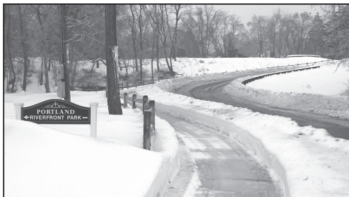
Snow blanketed the entrance to Riverfront Park in January of 2011. This year, we have easy access to the park...for now.