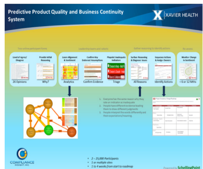
Quality Culture Improvement Program model