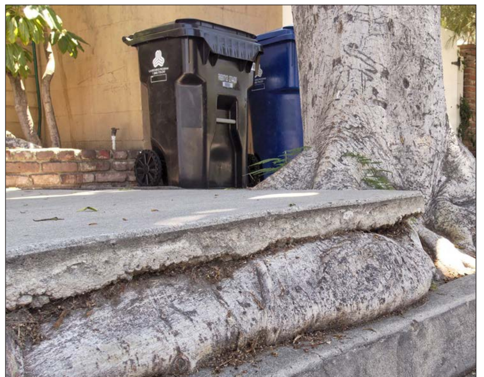
A tree root causes sidewalk damage.