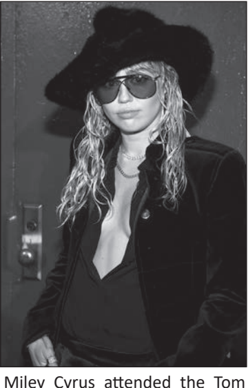
Miley Cyrus attended the Tom Ford show during Fashion Week on Monday.