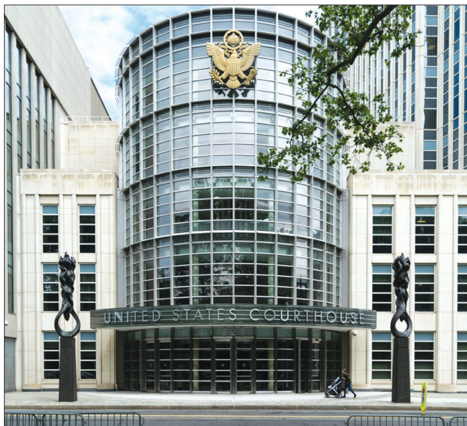
Federal prosecutors from the Eastern District of New York say five men, including two from Queens, defrauded mortgage lenders out of millions of dollars.

The defendants, if convicted, face 30 years in prison and a $1 million fine.