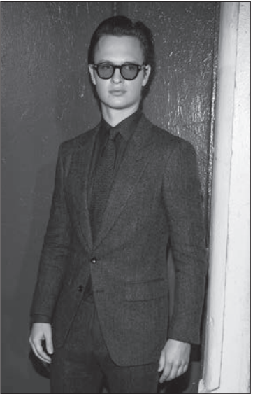
Ansel Elgort was at the Tom Ford show during Fashion Week on Monday.