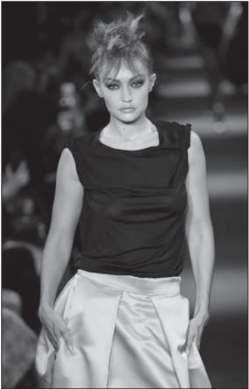
Gigi Hadid modeled an ensemble from the Tom Ford collection on Monday.