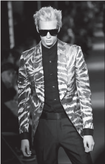
Funky fashion from the Tom Ford collection was modeled on Monday.