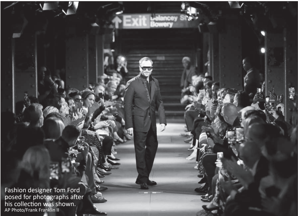
Fashion designer Tom Ford posed for photographs after his collection was shown.

never be the same, nor the Metropolitan Transit Authority workers in safety vests who stood watching on the tracks. Ford claimed a few key inspirations that he made his own, including a 1965 photo of Andy Warhol and muse Edie Sedgwick coming out of a manhole in New York. Also on his mood wall were shots of Isabelle Adjani and Christophe Lambert in Luc Besson's film "Subway," set in the Paris metro. "I remember so clearly when the film came out thinking how cool they both looked," Ford said in his show notes. "Especially the hair." Ford recalled a scene in which a bourgeois man at a dinner table asked Adjani what she called her hair style and she replied dryly: "Iroquois." There were other Sedgwick images that inspired Ford, including one of her in a silver bra and silver pants from the mid '60s. Also on his wall: Ursula Andress in a shiny metal bra from the Italian film "The 10th Victim." He looked back to the "breath-takingly beautiful" Yves Saint Laurent-Claude Lalanne breastplates YSL showed for autumn-winter 1969. The sculptress made casts of model Veruschka's chest and stomach. While working on his latest col-