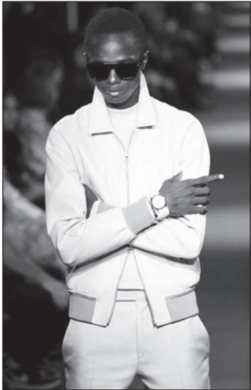
Sleek men's sportswear from the Tom Ford collection.

confused with simple. I think that it is a time for ease, and in that way a return to the kind of luxurious sportswear that America has become known for all over the world."