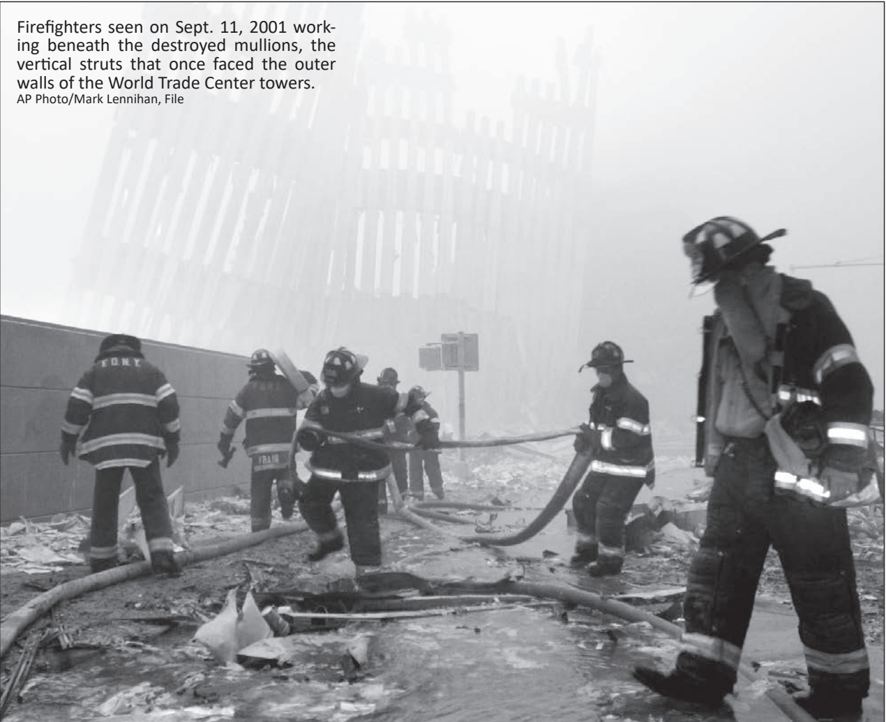
Firefighters seen on Sept. 11, 2001 working beneath the destroyed mullions, the vertical struts that once faced the outer walls of the World Trade Center towers.