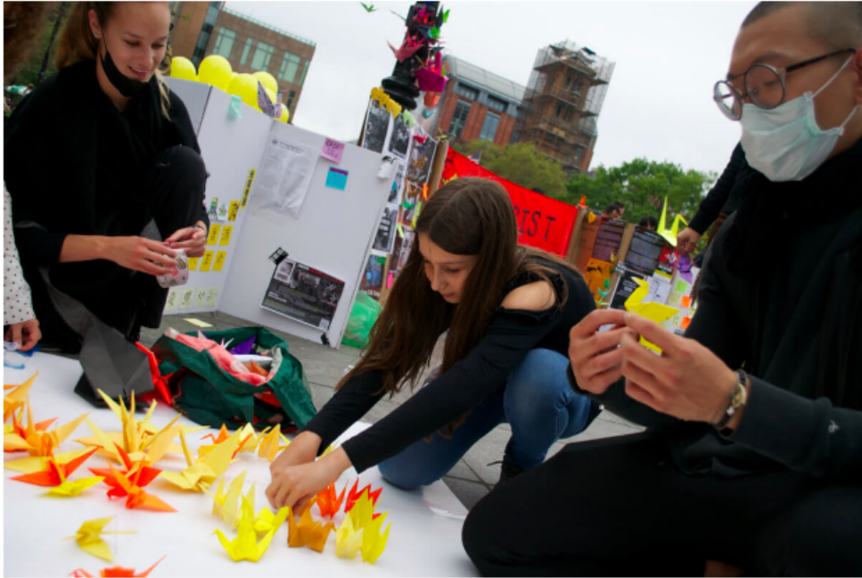
A girl visiting the park, center, decides to place a paper crane in support of the Hong Kong protest movement.