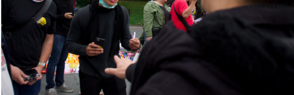
A mainland China supporter, right, argues about the protest movement in Hong Kong with Hong Kong supporters on his left.