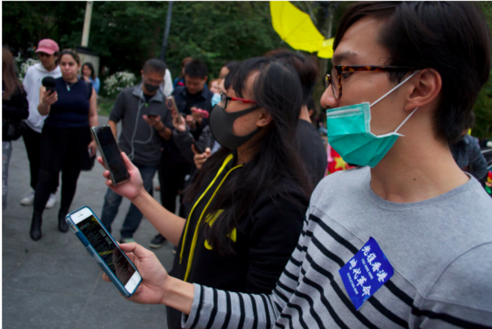
Attendees sing a song honoring Hong Kong.