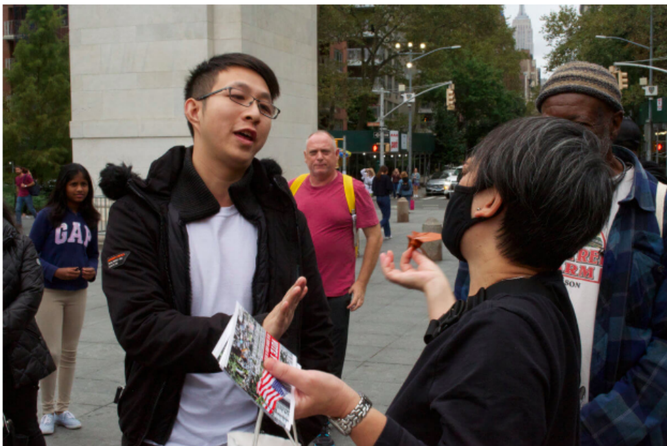
A mainland China supporter, left, declines to place a paper crane offered by a pro-Hong Kong activist, right.