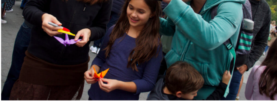
Three pedestrians visiting the park, right, learn about the solidarity event from a Hong Kong supporter, left.