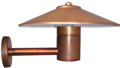
CATEGORY WALL MOUNT