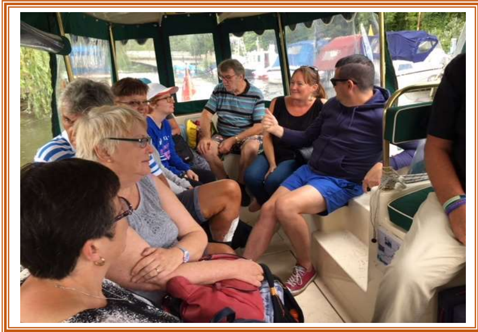
The Grove Ferry Boat Trip