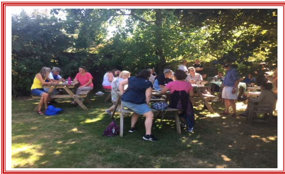
Visit to the Strawberry Farm