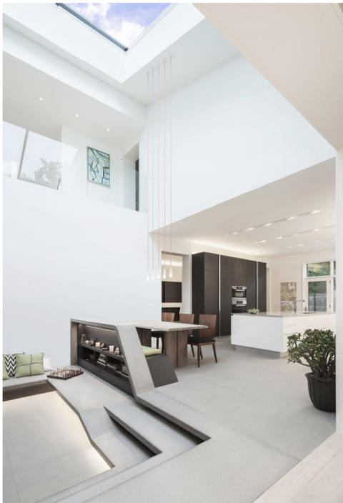
The core of the home, the 21-foot-tall atrium topped with a glass roof, is anchored by sculptural concrete steps fabricated by Steelskin.

Tagged with: atrium house • chicago architecture • detail • dSpace Studio • home renovation • Marcel Freides • skylight