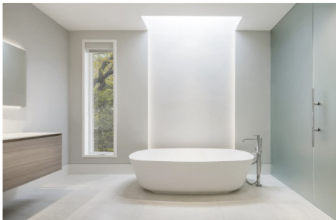
A skylight above the master bath extends the atrium motif. Linear LED fixtures edge the light well, drawing the eye up to the sky.