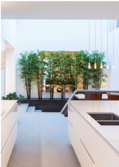
A bamboo "screen" rooted in a rock garden greets guests as they enter the home, bringing in greenery while blocking views of the kitchen.