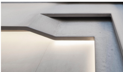
By day, the skylight fills the atrium with dazzling natural light. But by night, the space comes to life thanks to a pleasant glow emitted from within the architectural forms. Linear LED lights by Morton Grove, Illinois-based Luminii are integrated within the custom millwork and under the floating steps, reflecting off the white porcelain floor.