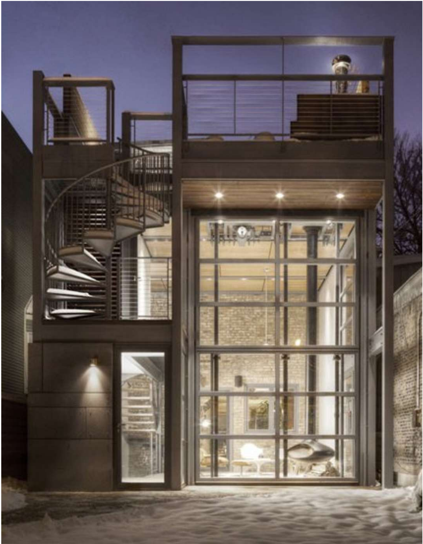
Modern Wicker Park Steel & Glass Chicago, USA Designed by dSPACE Studio Ltd, Kevin Toukoumidis Architecture Learn more about this project in the Architizer database.