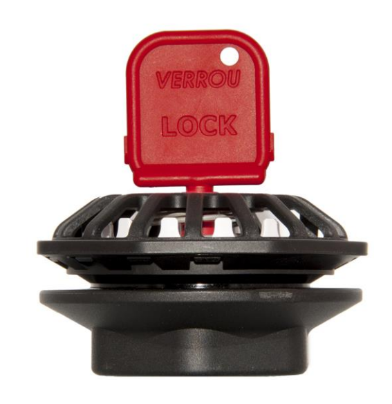
2110P HI-FLO RELIEF VALVE