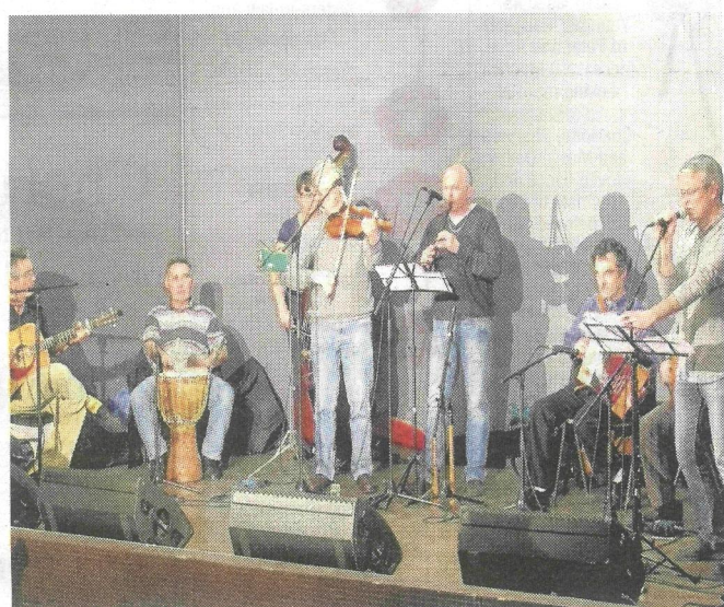
LYRICAL PROSE: The writers will be joined by folk band Bepsort

He said PlymLit16 was "fantastic for the city," and added: "It's fantastic to see so many arts organisations com-