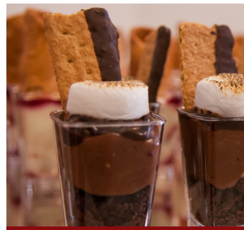
BEST OF THE BITE SIZED DESSERTS