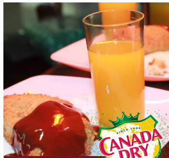
CANADA DRY HAPPY HOUR LOUNGE ADULT BEVERAGES, FOOD, MUSIC AND MORE!