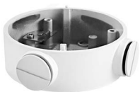
Electrical Box KI-AE260