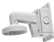
Wall Mount KI-AW2110B