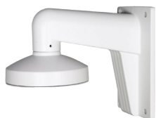
Wall Mount KI-AW4135