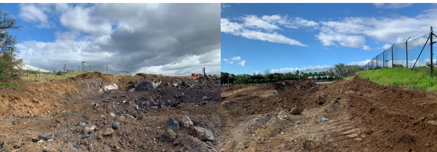
Above, difference in height after blasting and clearing the land.