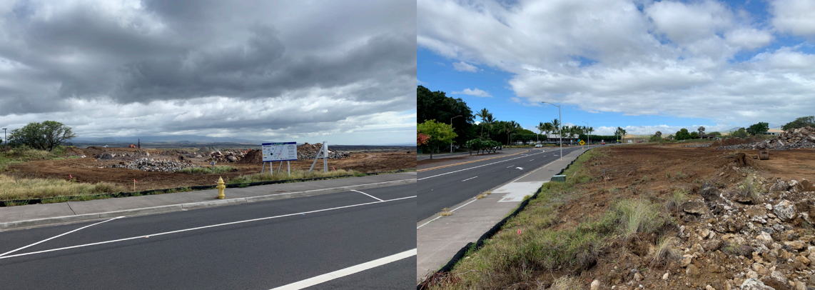
Above, northern edge of the site, bordered by Waikoloa Rd.

For questions or security concerns, contact: