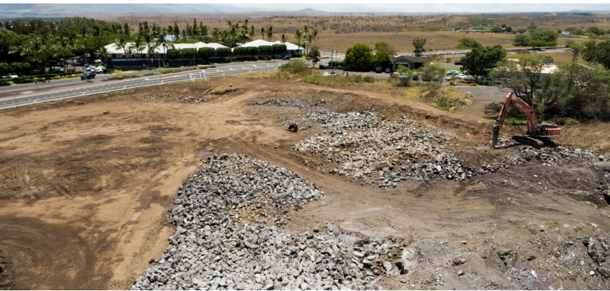
Above, view towards Waikoloa Rd. and Waikoloa Highlands Shopping Center, with blue rock ready for processing into gravel.

Scott Gaston sggfinancial@gmail.com (808) 769-0825