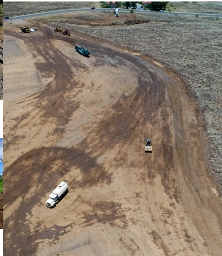
Below, western edge of the site.