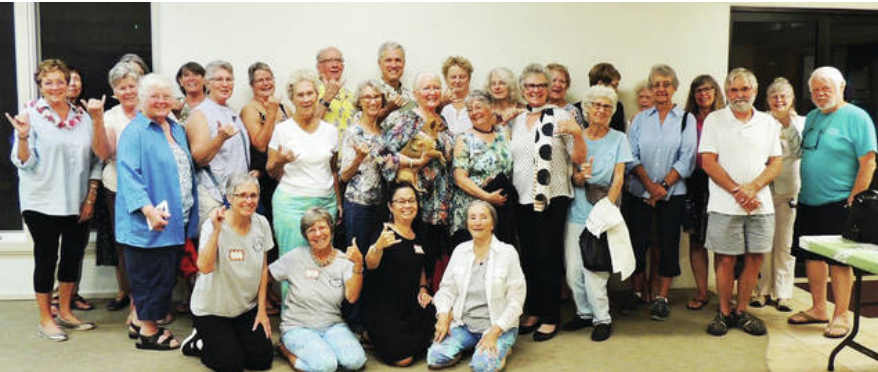
Members of the Friends of the Library - Waikoloa Region at a community meeting.