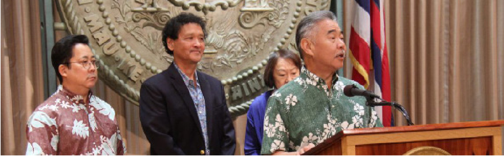
Gov. David Ige announces the release of $1.9 million in Capital Improvement Funds.