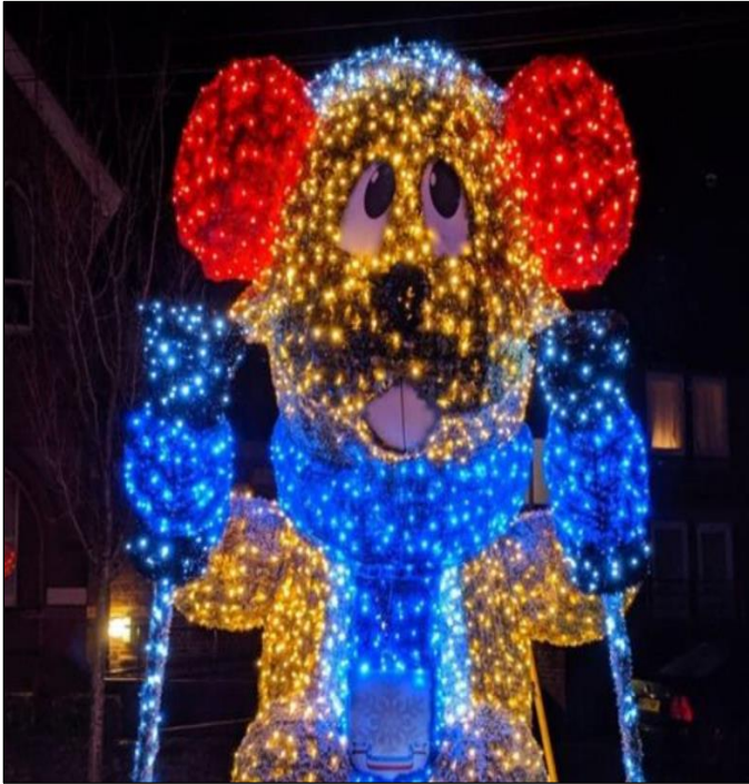
Pictured: Marmite the Marmot picture by a local estate agent taken from Bourne Estate Agents' Twitter page.

A giant skiing marmot that replaced a traditional tree as the Christmas display centrepiece in Alton, has divided the town. The Marmot, named Marmite because people either 'love or hate' it, cost £4,200 (second-hand), has hundreds of LED lights and is almost 5 metres tall! Some of the people who live in the town have described the decoration as hideous, embarrassing, not relevant to the season and ugly! Alton Town Council, who choose the display, said: "It was really about choosing something that would attract people to the High Street and bring a smile to people's faces, particularly the children. The marmot was felt to be the most unusual, quirky and was the best value."