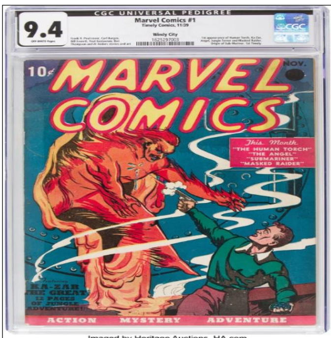
Pictured: The Marvel comic taken from the Heritage Auctions Twitter page.