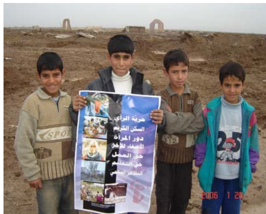
"We want them to Know their rights" Theatre project in Al-Munjed Al'Alla complex

Targeting Marsh Arab groups, the theatre performances are scheduled to be presented in 4 complexes in the suburb of Baghdad. Along the theatre presentation, the distribution of leaflets and further discussion with members of LAIC office will help participants to get acquainted with Human Rights values.