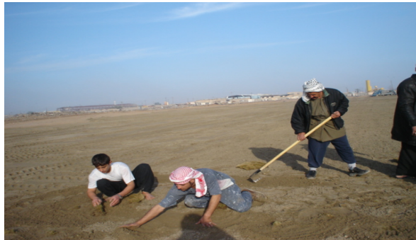
"Providing jobs for jobless persons is one of our goals" Football ground project/ Fallujah

The idea of establishing a football ground came to mind "after discussion with the local authorities" regarding a piece of land owned by a local Sports Club called A`alli Al Furat (Al Sumood) in Falluja.