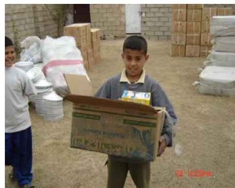
"Mercy Hands will support them as much as possible"

All Mercy Hands departments and staffs depend on PR products to amply introduce themselves and/or the scope of their activities within Mercy Hands. Usually, during official meetings and interviews, you are given few minutes to introduce yourself and the organization you represent. Without PR products (e.g. a website, newsletters, brochures, manuals, posters, etc), which should be presented during the meeting, your description of yourself and the organization will be always deficient and you would not leave a strong impression, at the audience, of yourself and/or the organization you represent. Simply, whatever your objective from the meeting, without PR products, you would fail.