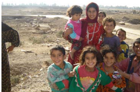
"We will always try to make them smile"

Once again, and despite of the difficulties encountered, a new copy of Mercy Hands Newsletter has been issued. Indeed, this couldn't be possible without the teamwork, dedication and persistence spirit of Public Relations Department and Amman Office.