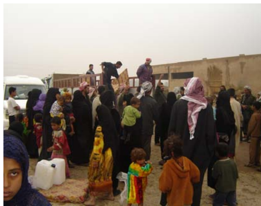
“NFI distribution in Al-Hadi Complex”

Later in January, and in context of its emergency humanitarian effort for Iraq, IOM planned to release two health kits from its emergency depot in Baghdad to be distributed in violence affected areas in Western Iraq. MH Emergency Assistance Program team prepared the two emergency health kits and coordinated with another IOM partner to deliver them to the final destination on 22 nd of January.