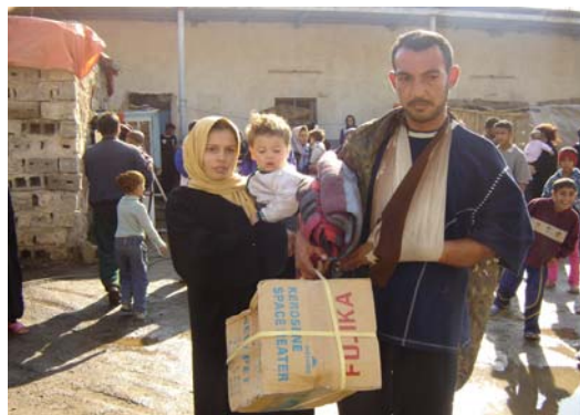
“Distribution of NFI in Military Shops Complex”

On 26 th of January, there was an arrangement for a new amendment (numbered 14) in which distribution of food items and NFIs are to be donated to IDPs in Anbar – 7 th operation - (in coordination with ICS) then added items to be donated to IDPs in Thi Qar and Basra (in coordination with INTERSOS)