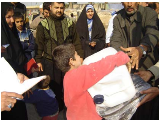
“Distribution of NFI in Al-Rasool complex”

Due to the persistent volatile situations and the consequent humanitarian crises inside Iraq, Mercy Hands has maintained a high level of preparedness and responsiveness, working in coordination and cooperation with the international community and active players on ground.