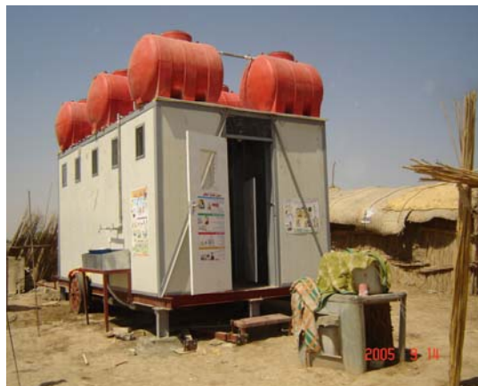
“One of mobile latrine in Gummaira village/Baghdad”

Concept papers would be submitted to IOM at soonest.